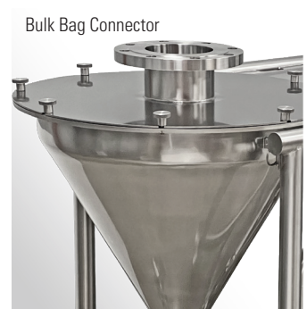
Bulk Bag Connector