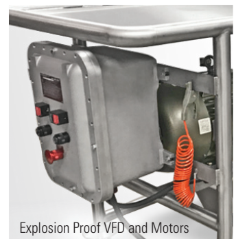
Explosion Proof VFD and Motors