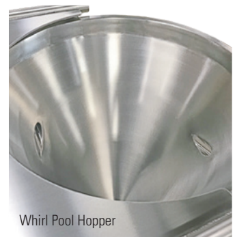
Whirl Pool Hopper