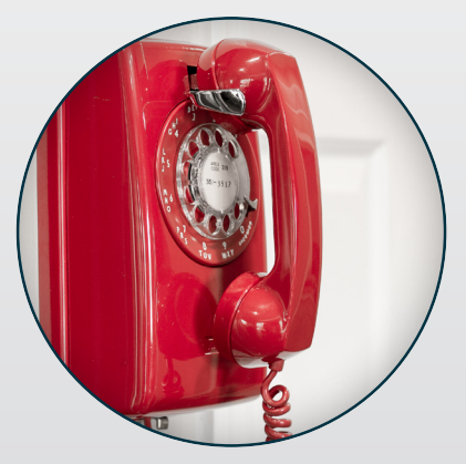
Is your phone still connected to the wall?