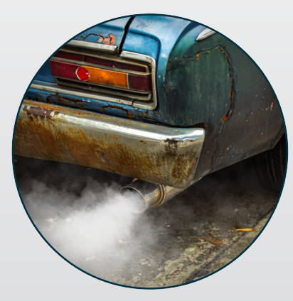
Does your car still get 15 mpg?