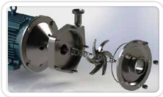
Exploded view LME-Series