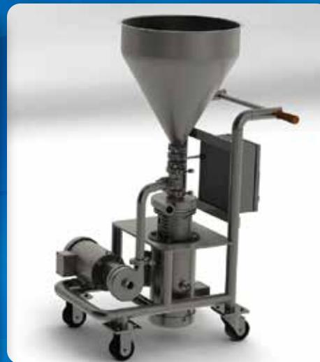
MODEL AC+2116 SYSTEM

Powder addition rate: up to 50 lbs. per minute (23kg/min) Normal liquid flow rate: 40 GPM (9.1 m 3 /hr) Powder addition inlet: 2 inch Liquid inlet: 1-1/2 inch (at feed pump) Liquid outlet: 1-1/2 inch Clamp connection standard Close coupled to a 5HP, 3600 RPM motor Shipped complete with supply pump, control panel and cart